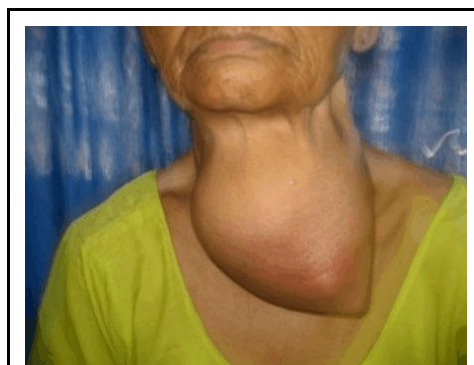
Figure 1. Multinodular goiter with a pointing thyroid abscess.

the anterior portion of her neck with overlying ulceration. The swelling had been present for the last 33 years, following her first pregnancy, and had since slowly increased in size (see Figure 1). She had a history of palpitations and being easily fatigued. The patient had developed hoarseness of voice and difficulty in swallowing over two months. She said she also had skin discoloration over two months and described rupture of the swelling with purulent discharge for one week. She had no history of neck irradiation, foreign body impaction, respiratory tract infection, or contact with tuberculosis. The patient's sister-in-law was also suffering from a goiter and had a history of dietary intake of iodine-deficient rock salt.